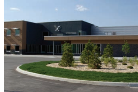
Valley View Public School, Ontario

Assistant Plant Manager-Special Projects. Valley View Public School also features a bio-filter water reuse system, occupancy sensors, and displacement ventilation. Effective use of glazing, orientation and shading devices maximizes daylight, and ensures beneficial solar heat gain in winter while avoiding solar loads in summer, according to Ackroyd.