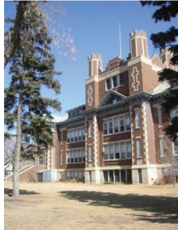
Buena Vista Public School, Saskatoon